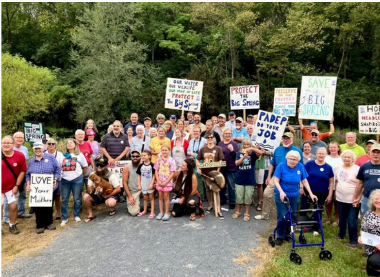
Citizens call on the DEP to protect the Big Spring in August 2025.