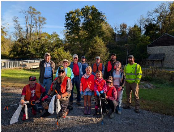
Cleanup Volunteers in October 2025

Thank you to all of the volunteers! Your tireless efforts have made all of BSWA's accomplishments possible. We encourage all members of the community to join BSWA's activities. Membership dues also support our activities. If you have not already, please consider renewing your membership or making a donation to BSWA. Click here for the membership form.