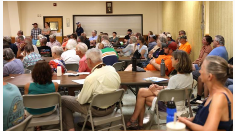
Local residents attend the DEP public hearing in August 2025