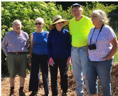
The gardening crew after watering and weeding the bird and pollinator garden.