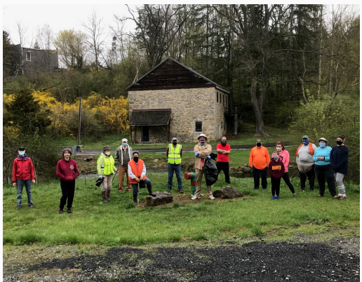
Volunteers are set to get to work at our spring cleanup in April.

Thank you to all the volunteers. Your tireless hours of work have made these accomplishments possible. If you have not already, please consider renewing your membership or making a donation to BSWA to the address listed below.